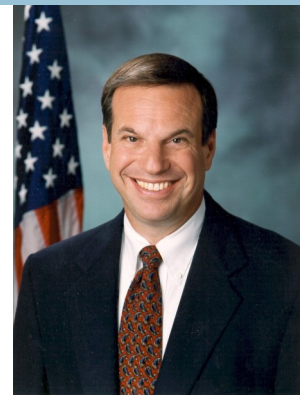
Congressman Bob Filner (D-CA) Chairman, House Committee on Veterans Affairs

"CVE's function has shifted from assisting Veteran Owned Business and SDVOB. It has essentially become an information and referrals agency due to lack of resources and support. There is indeed a lack of transparency in the application process and wait time to apply for certification." ~~