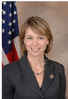
Congresswoman Stephanie Herseth Sandlin, (D-SD) Chairwoman House VA Subcommittee on Economic Opportunity

"Today's economy is particularly challenging for veterans, some who have sacrificed work experience or delayed education to serve in the military. I, along with other Members of this Committee, need to know what resources are needed in order to be successful."~~