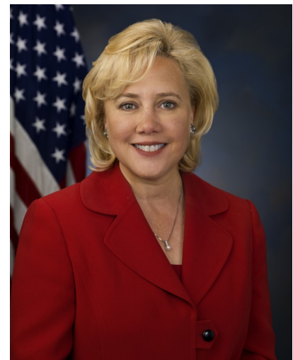
Senator Mary Landrieu, (D-LA) Chair

Members of the Small Business Committee of the 112 th Congress include Carl Levin, D-Mich., Tom Harkin, D-Iowa, John Kerry, D-Mass., Joseph Lieberman, ID-Conn., Maria Cantwell, D-Wash., Mark Pryor, D-Ark., Benjamin Cardin, D-Md., Jeanne Shaheen, D-N.H., Kay Hagan, D-N.C., Olympia Snowe, R-Maine, David Vitter, R-La., Jim Risch, R-Idaho, Marco Rubio, R-Fla., Rand Paul, R-Ky., Kelly Ayotte, R-N.H., Mike Enzi, R-Wyo. and Scott Brown, R-Mass.~~