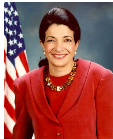
Senator Olympia Snowe (R-ME) Ranking Member